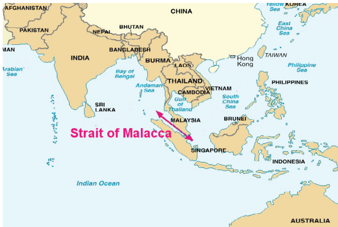
Figure 2. Strait of Malacca 97